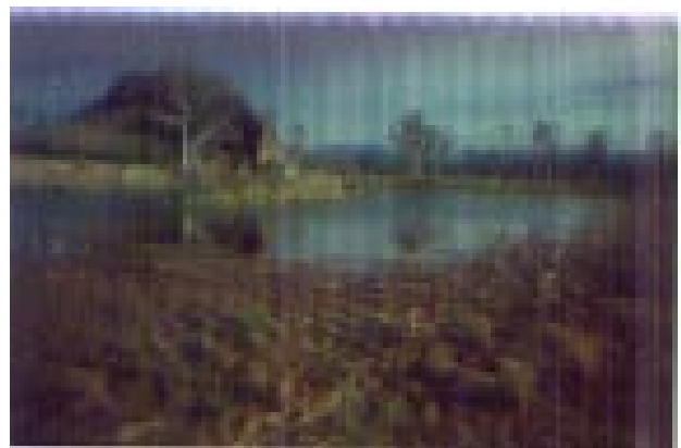
Figure 3. A semi-permanent waterhole located in the bed of the Finke River, near its source, 3 km upstream from Glen Helen Gorge, Northern Territory.

In the low lying regions of central Australia, water-courses scour out coarse bed material during rare floods, and quite large holes may be formed, especially where