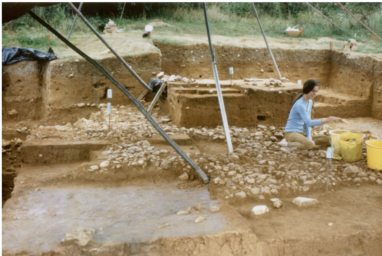
A horizontal exposure of a stone pavage found in the uppermost Paleolithic occupation floor at Solvieux.

thought. Hence the premise on which the debate was founded became questionable fairly early in the game. Then again, Bordes himself actually debated very little, at least in print, and then largely in English. For the issue was very much an Anglo-Saxon affair which was met with a mixture of bemusement, if not indifference, in France itself. Finally, to be frank, it would be interesting to know whether the “debate” itself was not something of a canard in any event. The only source for many of the popular notions Americans hold about it derive from the imaginative Selbfestschriften which Binford himself wrote as companion pieces to his own articles. This is not to say, I hasten to add, that Bordes would not have enjoyed a confrontation with Binford along personal lines. Although I never saw the two of them together, I suspect that Bordes was genuinely attracted to Binford, a man whose intelligence, brand of humor, combativeness, and need for self-assertion matched his own, and who—not being a Paleolithic archaeologist himself—could enthusiastically confront Bordes in a manner he might not tolerate from a fellow expert in the trade.