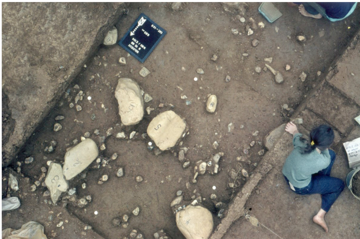
A horizontal exposure of a stone pavage found in the uppermost Paleolithic occupation floor at Solvieux.

indeed activity-specific, most likely representing varying expressions that one and the same culture might take in its seasonal rounds; and that he only later abandon this view because he could find no corresponding differences in their associations with faunal assemblages, hearths, site organization, and so forth. I took this to mean that he viewed the question of Mousterian variability—as he did most Paleolithic issues—as a largely empirical matter which could only be resolved on strictly empirical terms. Here of course he was speaking in the guise of a straight archaeologist for whom paleoethnological interpretation could wait. The second time the subject came up his words took a more cynical turn: in short, that the debate's real value lay in the fact that it was an easily grasped and easily popularized matter that served to promote his reputation among Anglo-Saxon archaeologists and students who were otherwise too ignorant of Paleolithic archaeology to know the difference between a burin and a hand-axe.